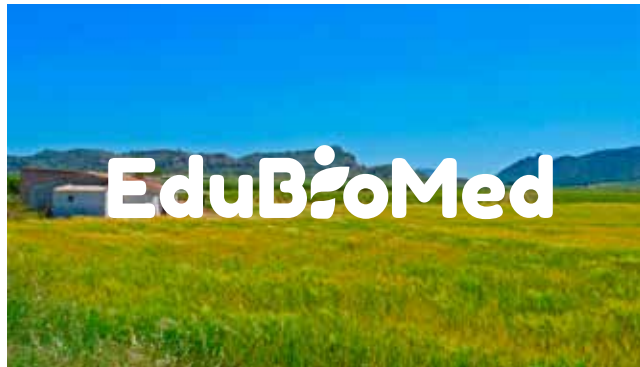
3 c. Main one color white on photographic background